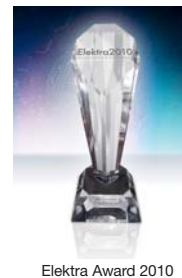
Elekra Award 2010