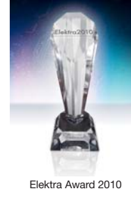
Elektra Award 2010