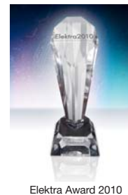
Elektra Award 2010