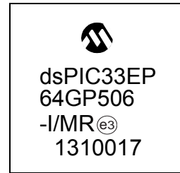
64-Lead TQFP (10x10x1 mm)