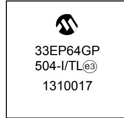
44-Lead VTLA (TLA)