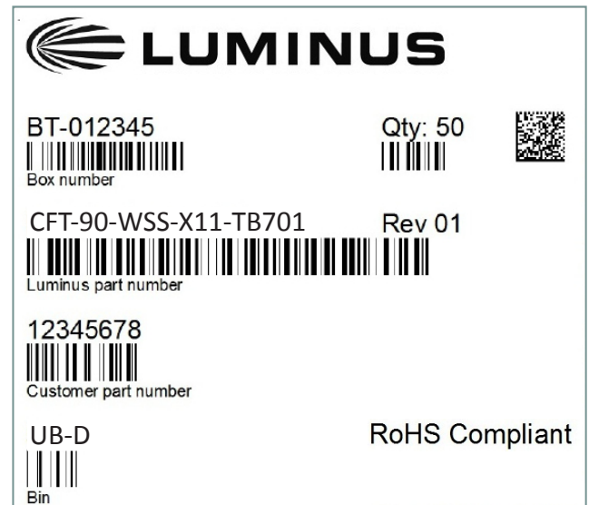
Sample label –for illustration only