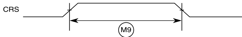
Figure 43. MII async inputs timing diagram