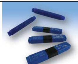
Single In-Line Splices Dual In-Line Splices Electronic Splices