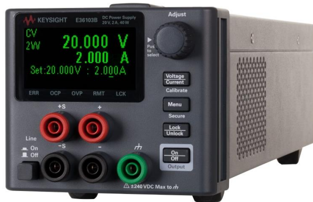
Option J01 recessed binding posts

Do you need to convert the power supply for different mains power? The two switches on the bottom of the instrument make it straightforward. See the product manual for details.