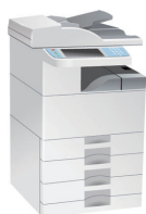
Office Automation Equipment (Copier, Printer)