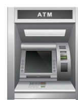
Vending Machine, ATM