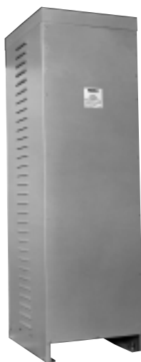
5000/6000 Series Enclosed Unit