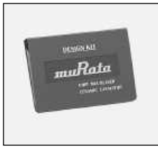
A. 7-3/4x5 Blue Binder with Sleeves