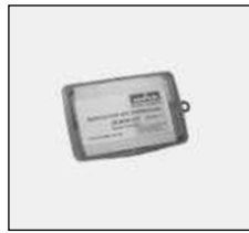
C. Soft Plastic Case