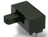
L10201ML04Q Horizontal Actuation SPDT

For mounting information, see TERMINATIONS section, page I-23.