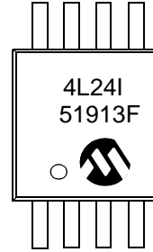
8-Lead 2x3 DFN