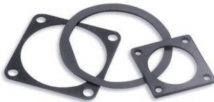
Jam Nut Type