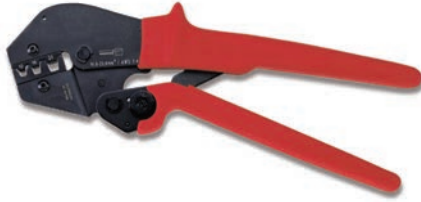
Ratcheted Hand Tool

A range of single action, factory calibrated tools are available to support the stamped contacts and 30 A power contacts.