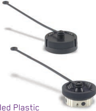
Plug Dust Cap