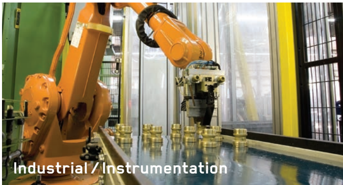
Industrial / Instrumentation