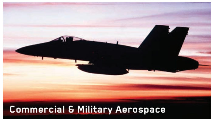
Commercial & Military Aerospace

Our connector portfolio remains the most extensive in the industry.