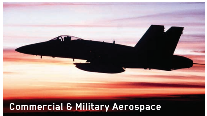
Commercial & Military Aerospace