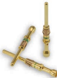
Size 16 AWG, No Insulation Grip