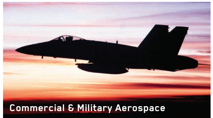
Commercial & Military Aerospace

Our connector portfolio remains the most extensive in the industry.