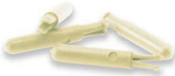
Discriminating Pin Insertion