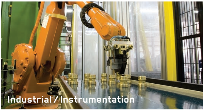
Industrial / Instrumentation