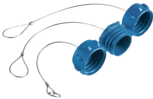
PX0990, PX0991, PX0992