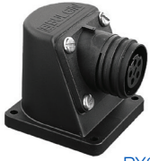
PX0950 & PX0941