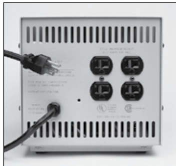
60 Hz, 70 – 1000 VA, (4) 5-15R Receptacles