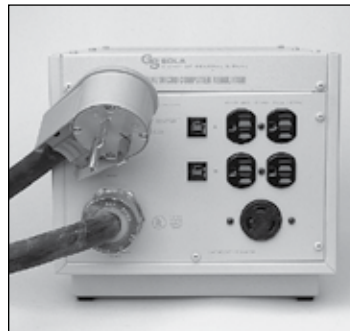
60 Hz, 2000–3000 VA, (4) 5-15R and (1) L5-30P Receptacle