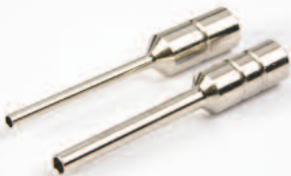
PNo 14944/SP PNo 14945/SP