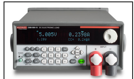
Model 2380-500-15 front view showing the safety covers on the input terminals.