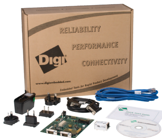
Digi Connect ME kits shown