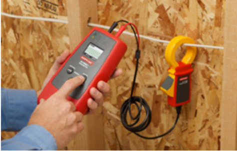
Induce signal with the signal clamp when there is no bare conductor.