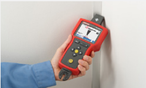
Use the Tip Sensor to trace wires in hard to reach areas.