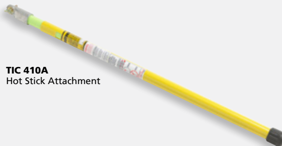
TIC 410A Hot Stick Attachment

The optional TIC 410A Hot Stick accessory enables easier tracing of wires in high ceilings, walls and along floors.