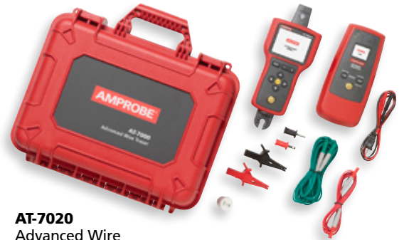
AT-7020 Advanced Wire Tracer Kit