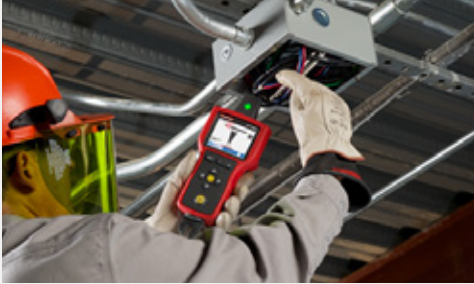
Trace energized or de-energized wires by removing the junction box cover.