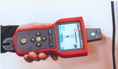
Non-contact voltage (NCV) detection.