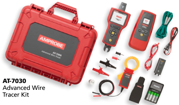
AT-7030 Advanced Wire Tracer Kit