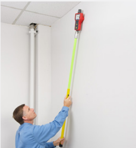
Trace wires in hard to reach places with the TIC 410A.