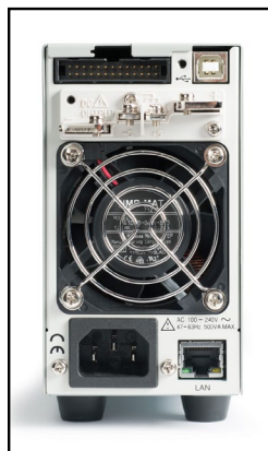
Rear panel of 360W models.

* Replace the specific power supply model number in place of Model Number to generate the appropriate model number for a service item. For example, for Model 2260B-30-36, a 1-year extended warranty model number would be 2260B-30-36-1-EW.