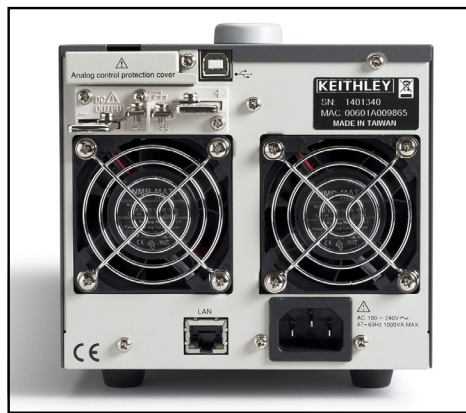
Rear panel of 720W models.