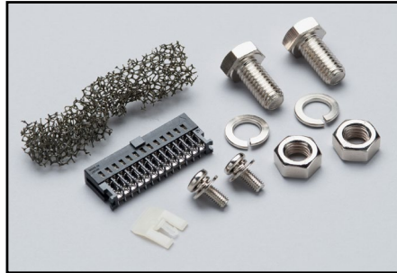
Model 2260-004: Accessory Kit (30V and 80V models): Air filter, analog connector cover, analog control lock lever, M8-size output terminal bolts, washers and screws, and M4-size output terminal screws with washers.