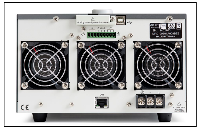
Rear panel of 1080W models.