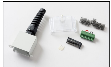
Model 2260-010: Basic Accessories Kit (250V and 800V models): Air filter, analog protection cover, analog control lock lever, output terminal cover, output terminal connector, strain relief.