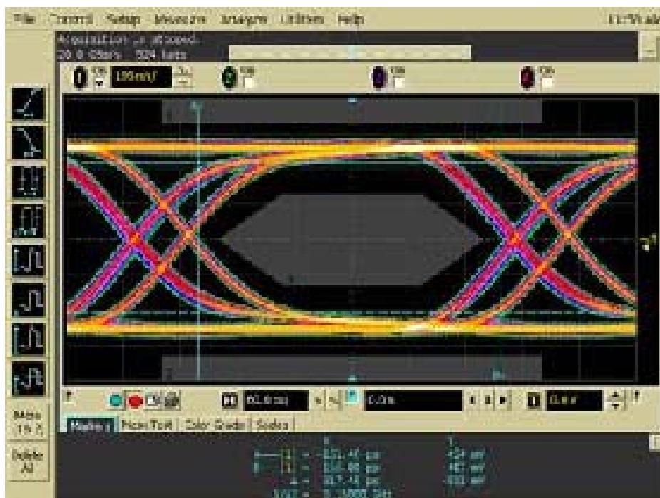
Figure 7: 12bit deep color DVI/HDMI TX eye tested with 1 meter, 30 AWG HDMI cable. Setting: Optimized equalization, 0dB output pre-emphasis and de-emphasis, and Swing 500mV.