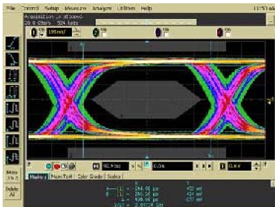
Figure 6: 8bit deep color DVI/HDMI TX eye tested with 25 meter. 24 AWG HDMI cable. Setting: Optimized equalization, 0dB output pre-emphasis and de-emphasis, and Swing 500mV.