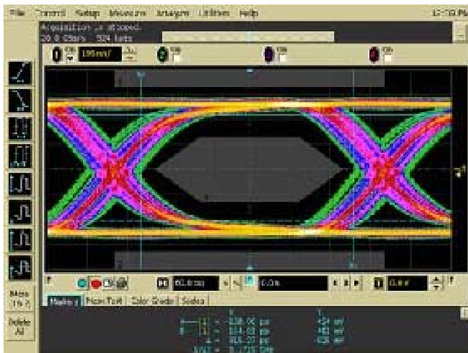
Figure 8: 12bit deep color DVI/HDMI TX eye tested with 20 meter, 24 AWG HDMI cable. Setting: Optimized equalization, 0dB output pre-emphasis and de-emphasis, and Swing 500mV.