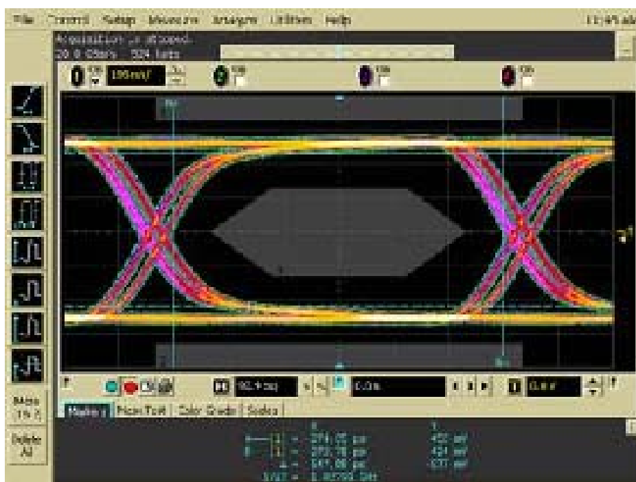
Figure 4: 8bit deep color DVI/HDMI TX eye tested with 10 meter. 24 AWG HDMI cable. Setting: Optimized equalization, 0dB output pre-emphasis and de-emphasis, and Swing 500mV.