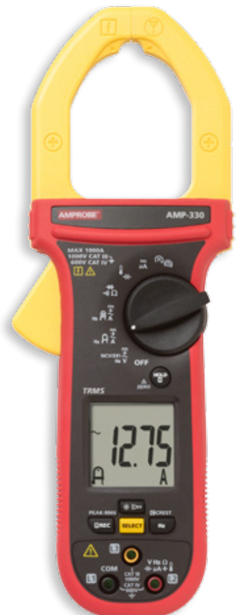
AMP-330 AC/DC 1000 A Clamp Meter Industrial Motor Maintenance