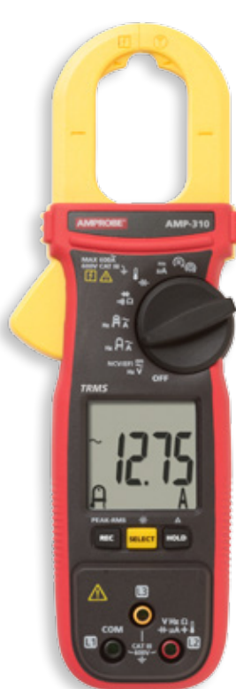
AMP-310 AC Clamp Meter HVAC