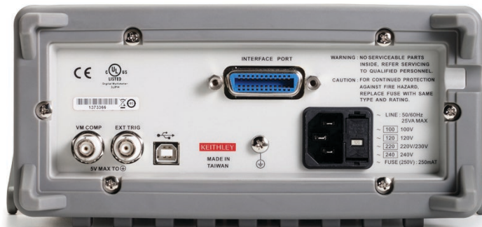
Model 2110 rear panel.

Input bias current: <30pA at 25°C. Input protection: 1000V all ranges (2W input). AC CMRR: 70dB (for 1kΩ unbalance LO lead). Power Supply: 100V/120V/220V/240V. Power Line Frequency: 50/60Hz auto detected. Power Consumption: 25VA max. Digital I/O interface: USB-compatible Type B connection, GPIB (option). Environment: For indoor use only. Operating Temperature: 0° to 40°C. Operating Humidity: Maximum relative humidity 80% for temperature up to 31°C. Storage Temperature: –40° to 70°C. Operating Altitude Up to 2000 m above sea level. Bench Dimensions (with handles and bumpers): 107 mm high × 252.8 mm wide × 305 mm deep (3.49 in. × 9.95 in. × 12.00 in.). Weight: 2.23 kg ( 4.92 lbs.). Safety: Conforms to European Union Low Voltage Directive, EN61010-1. Measurement Cat I 1000V and CAT II 600V. EMC: Conforms to European Union Directive 89/336/EEC, EN61326-1. Warranty: Three years.