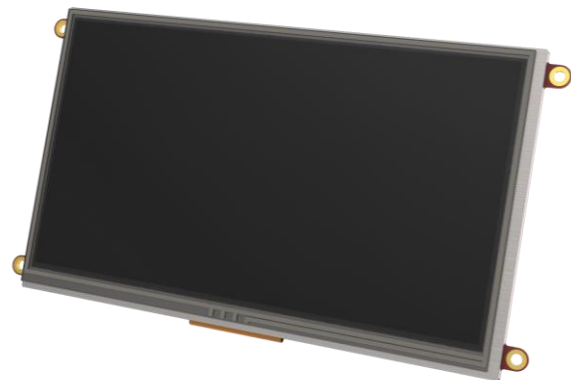
The uLCD-70DT Display Module

NOTE (*): Arduino remains the property of the Arduino Team. All references to the word Arduino and Arduino Hardware are licensed under the Creative Commons Attribution Share-Alike license.