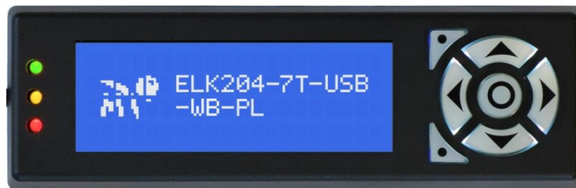
Figure 2: ELK204-7T-1U-PL