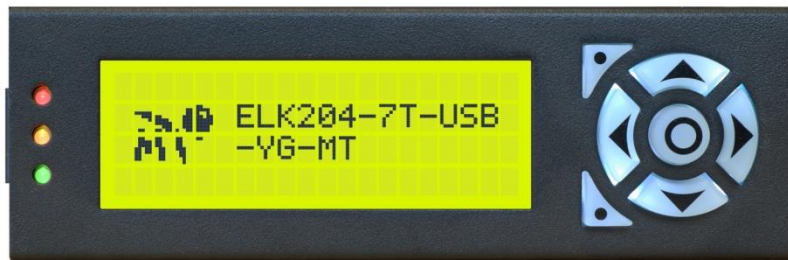
Figure 1: ELK204-7T-1U-MT

The versatile Enclosure Series, with all the features mentioned above, is available in a variety of colour and material options to suit almost any application.