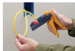
3. Insert jack in JackRapid front first with IDC slots facing blades of JackRapid.