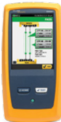
More on page 21