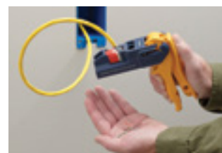
6. Wires will be seated and cut for a solid termination.