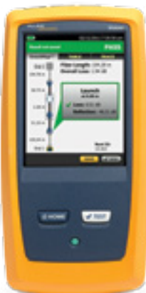
More on page 20