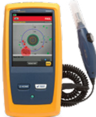
More on page 28