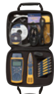
CableIQ Advanced IT Kit

CableIQ Gigabit Service Kit combines powerful Gigabit cable and network testing. Expedites problem resolution and facilitates moves, adds, changes, and upgrades. Documents cabling bandwidth and network link speed.