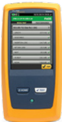
More on page 5

Faster systems acceptance for all copper and fiber certification jobs.