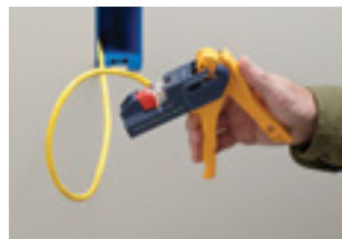
4. Ensure jack is completely and securely inserted in jack holder bed with IDC slots facing the blades.