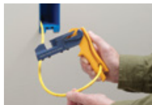
1. Strip cable jacket with a standard cable stripper or the built-in cable stripper.

Get accurate terminations and clean, consistent cuts every time with the JackRapid Termination Tool.