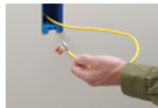
2. Determine wiring scheme. Dress all four pairs (eight wires).