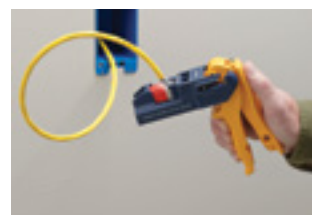
5. Pull trigger completely and remove excess wire prior to releasing trigger.