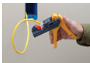
4. Ensure jack is completely and securely inserted in jack holder bed with IDC slots facing the blades.