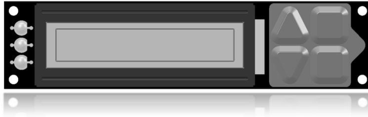
Figure 1: LK162A-4T Display

The LK162A-4T is an intelligent alphanumeric liquid crystal display designed to decrease development time by providing an instant solution to any project. In addition to the RS232, TTL and I2C protocols available in the standard model, the USB communication model allows the LK162A-4T to be connected to a wide variety of host controllers. Communication speeds of up to 115.2kbps for serial protocols and 100kbps for I 2 C ensure lightning fast display updates.