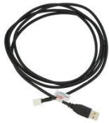
Figure 5: Four Pin USB Cable (CBL-USBA24PIN3FT)

The Four Pin USB cable is recommended for the LK162A-4T-USB display. It will connect to the keyed, friction lock style header on the unit and provide a connection to a regular A style USB connector, commonly found on a PC.