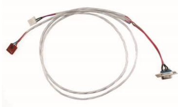
Figure 3: Communication/Power Cable (SCCPC5V)

The most common cable choice for any alphanumeric Matrix Orbital Display, the Communication/ Power Cable offers a simple connection to the unit with familiar interfaces. DB9 and floppy power headers provide all necessary input to drive your display.