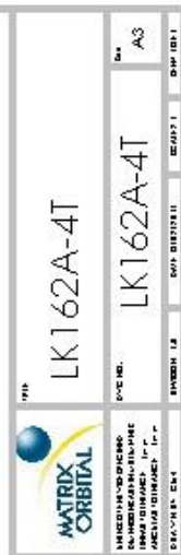
Figure 14: LK162A-4T Dimensional Drawing