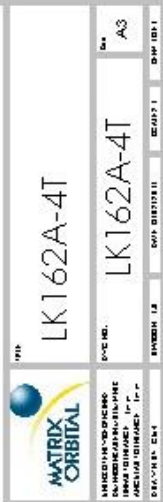
Figure 14: LK162A-4T Dimensional Drawing