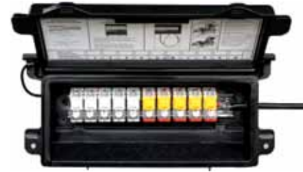
3M™ SLiC™ Stubbed Aerial Terminal with 3M™ Termination Module MX2000 unprotected/protected Terminal Block