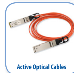
Active Optical Cables