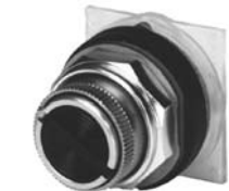
Selector Push Button 9001KQ

For use in hazardous locations, see page 23. Legend plate and contact block not included. Inserts are field convertible. For colors not listed, order operator without insert, plus separate color insert from page 28. Up to two 9001KA contact blocks can be mounted in tandem (total of four blocks). Selector push buttons cannot be illuminated.