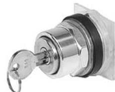
Key Operated Push Button 9001KR

For use in hazardous locations, see page 23. Key operated push buttons are used wherever unauthorized use of a push button is discouraged. Examples are locking a Start push button in the extended position or locking a Stop push button in the depressed position. The operator can also be locked in the flush position—holding all contacts open. Up to two 9001KA contact blocks can be mounted in tandem (total of four blocks). Legend Plate and Contact Block Not Included (“x” = locked position).