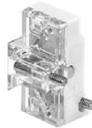
Push-on Push-off Module 9001K85

This module can be added to standard 9001K, 9001KX, 9001SK or 9001T momentary push button operators. Contact blocks mounted behind this module (maximum of 2) are held in the depressed position when the operator is pressed once, and released to their normal position when the operator is pressed again. For a N.C. circuit, use a 9001KA3 or the N.C. contact of either a 9001KA1 or 9001KA4. For a N.O. circuit, use the N.O. contact of either a 9001KA4 or 9001KA6.