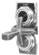
Rocker Arm Operating Lever 9001K50