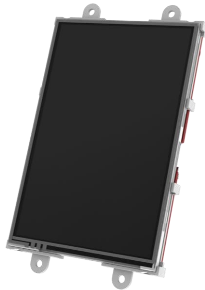
The uLCD-35DT Display Module

NOTE (*): Arduino remains the property of the Arduino Team. All references to the word Arduino and Arduino Hardware are licensed under the Creative Commons Attribution Share-Alike license.