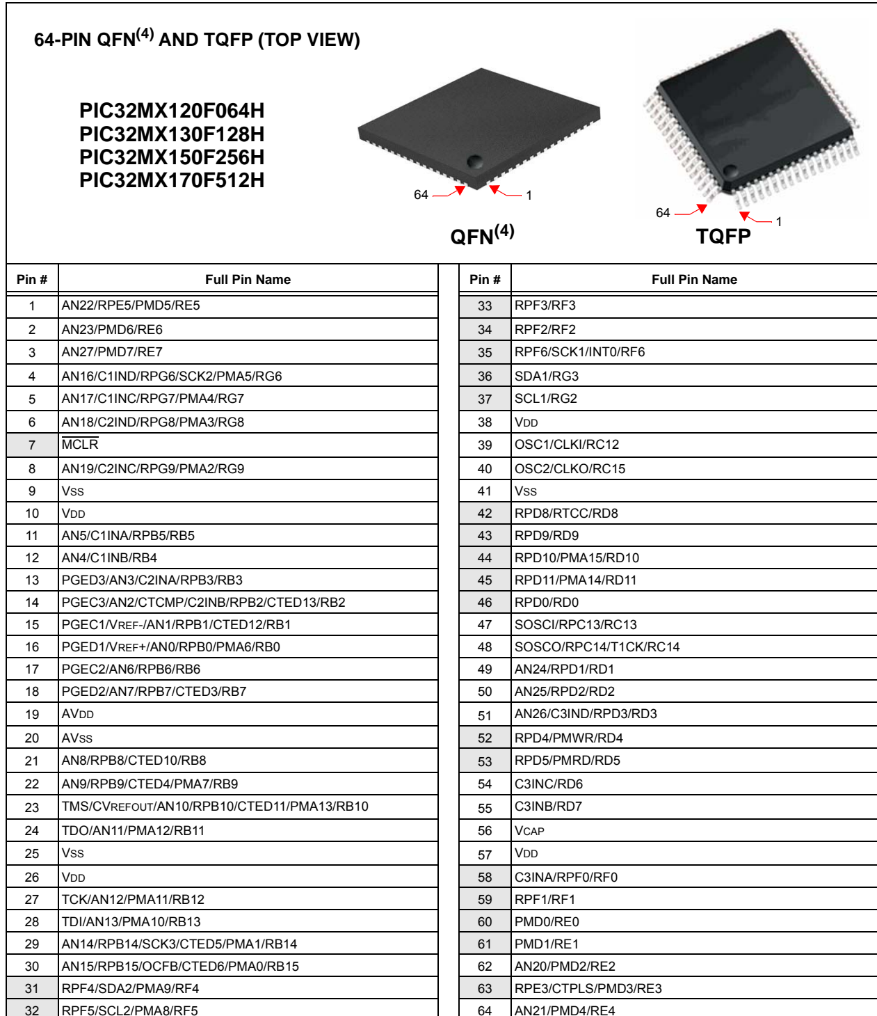
TABLE 2: PIN NAMES FOR 64-PIN GENERAL PURPOSE DEVICES