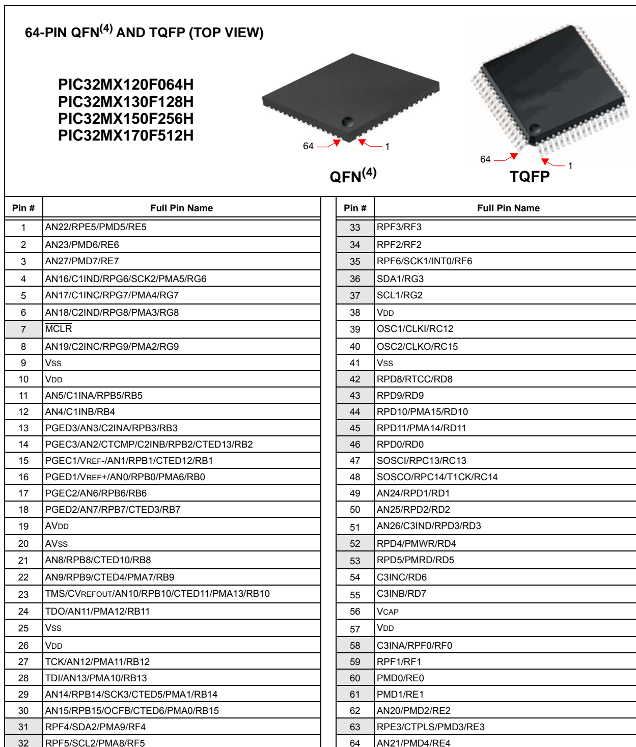
TABLE 2: PIN NAMES FOR 64-PIN GENERAL PURPOSE DEVICES